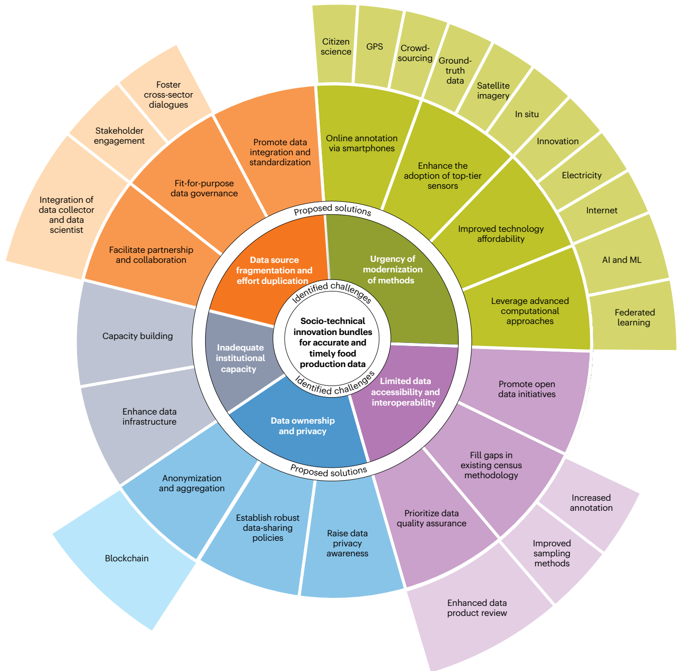
Fig. 3 | Challenges and potential solutions to address global food production data scarcity. The five key challenges for transforming the food production data landscape (inner wedges) and their proposed solutions which can be utilized, in combination, to form socio-technical innovation bundles to effectively

and sustainably address food production data scarcity (outer two wedges). Such coordinated efforts will be crucial for globally ensuring the accuracy and timeliness of food production data. AI, artificial intelligence; GPS, Global Positioning System; ML, machine learning.